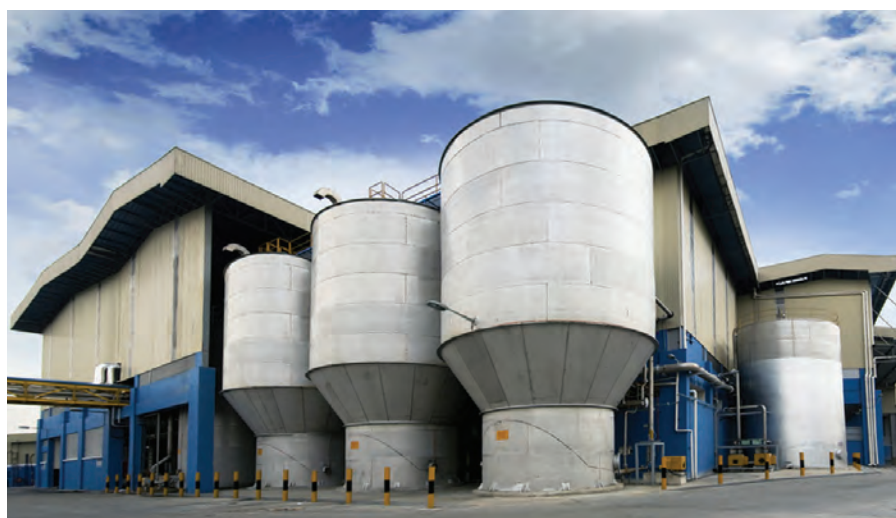
PM 6 machine building- storage towers (foreground)

the paper mills. Recently there have been occasions when the mill encountered a temporary shortage of waste paper collection domestically. To overcome this, Muda Paper has no choice but to resort to importing wastepaper from countries from as far as Japan, Australia, New Zealand, United Kingdom, Denmark and Sweden.