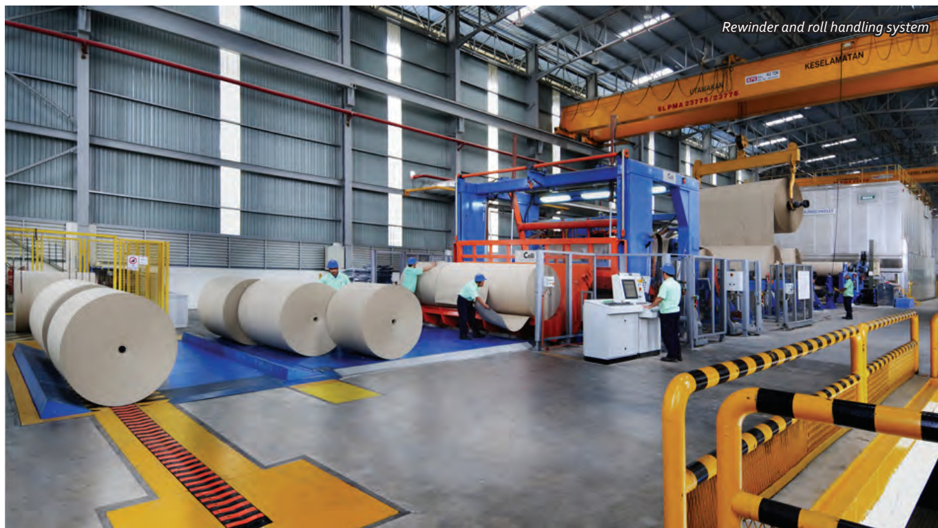
Rewinder and roll handling system