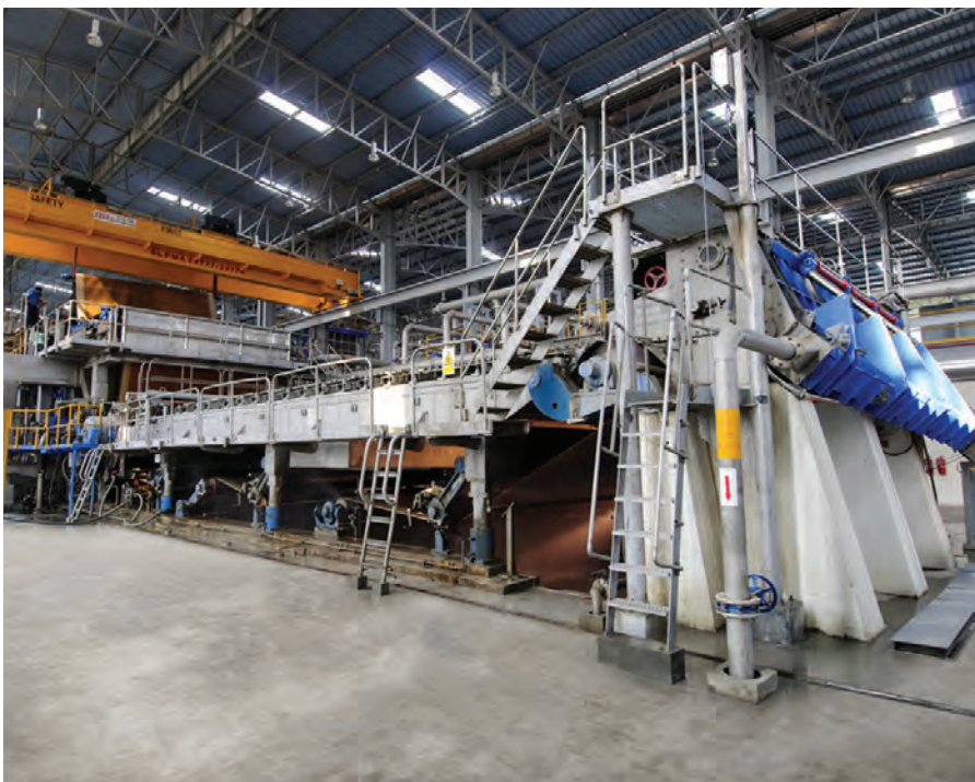
Wet end of PM 6